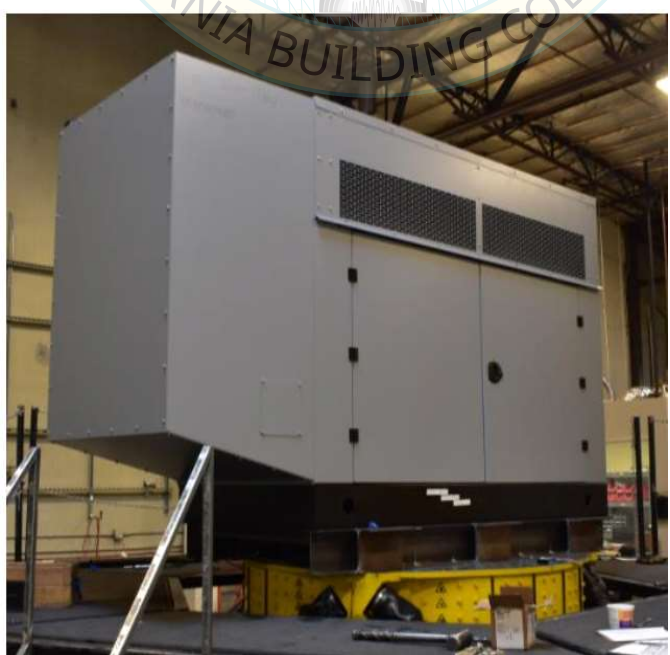
All units were filled with contents and maintained structural integrity and functionality after AC-156 test.

UUT-7A was rigidly mounted to the shake table using (6) 5/8" diameter Grade 8 bolts.