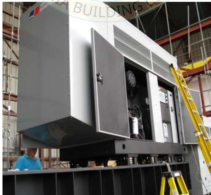
All units were filled with contents and maintained structural integrity and functionality after AC-156 test.

UUT-6A was isolated using (8) VMC MSSH-1E spring isolators. The isolators were connected to the equipment using (1) 3/4" Grade 8 bolt each, and were connected to the tank using (4) 5/8" diameter Grade 8 bolts per isolator. The tank was rigidly connected to the shake table using (20) 5/8" Grade 8 bolts.