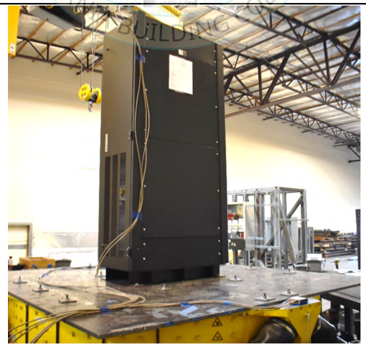
Overall view of UUT-05

The shake table interface plate was mounted to the shake table using M12 threaded rod spaced roughly 12" on center.