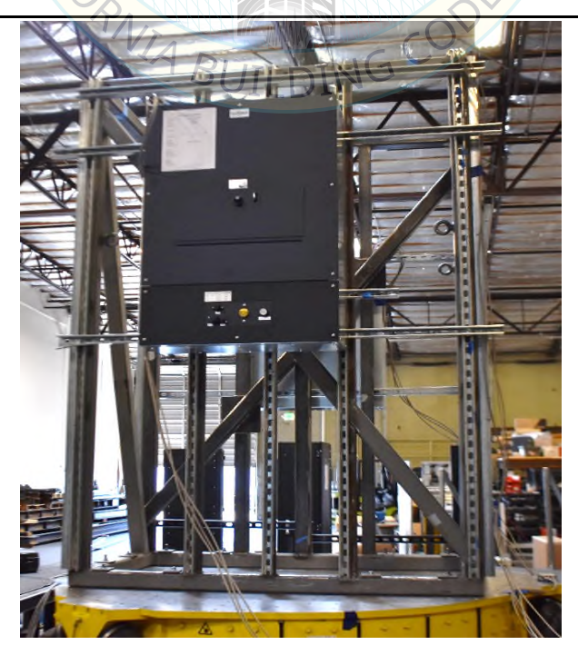
Overall view of UUT-02

UUT-02 was mounted to the shake table interface frame at the 4 corners utilizing 3/8-inch grade 5 bolts, washers, 1/4-inch thick plate washers, and channel nuts.