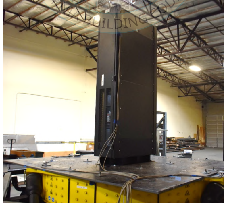
Overall view of UUT-04

The shake table interface plate was mounted to the shake table using M12 threaded rod spaced roughly 12" on center.