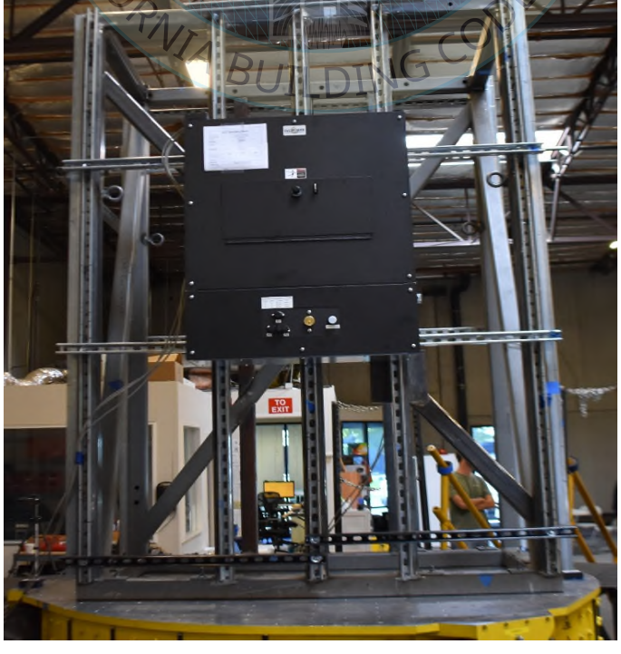
Overall view of UUT-01

UUT-01 was mounted to the shake table interface frame at the 4 corners utilizing 3/8-inch grade 5 bolts, washers, 1/4-inch thick plate washers, and channel nuts.