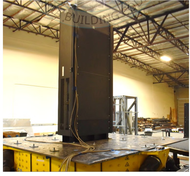
Overall view of UUT-03

The shake table interface plate was mounted to the shake table using M12 threaded rod spaced roughly 12" on center.