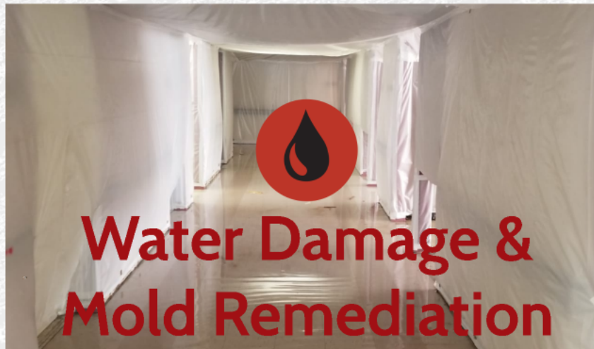
Water Damage & Mold Remediation