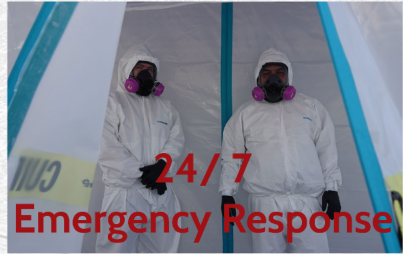
24/7 Emergency Response