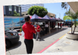
Celebration after another successful project!