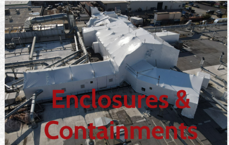
Enclosures & Containments