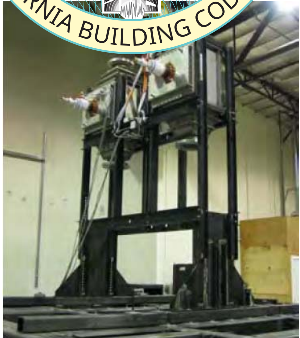
Overall view of UUT-02